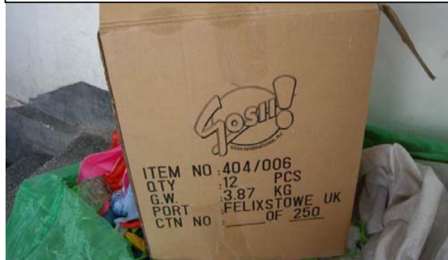
Image: Box found in Pearl Tower. Gosh International is a UK invested company.