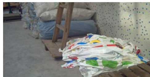
Image: Image of a pile of Twister, Hasbro's product being tossed aside in the factory.

Chemicals such as paint and diluents are used in the silk print department. However, Duoyuan does not provide any related chemical information nor does it distribute any safety equipment.