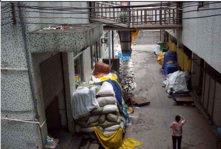
Image: The factory is unorganized and dirty, image shows Duoyuan's true color.

The work environment is very dirty and unorganized. One can see raw materials, work equipment, garbage, unfinished products and finished products piled up at random locations, including the emergency exits.