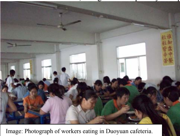
Image: Photograph of workers eating in Duoyuan cafeteria.

Duoyuan enforces a $2 RMB/day meal fee on all workers. The cafeteria offers three meals daily, breakfast consists of congee, and lunch and dinner include three dishes per meal. The dishes consist of tomato and potato etc. Each meal is provided before the worker's meal break, though it lacks quantity and quality.