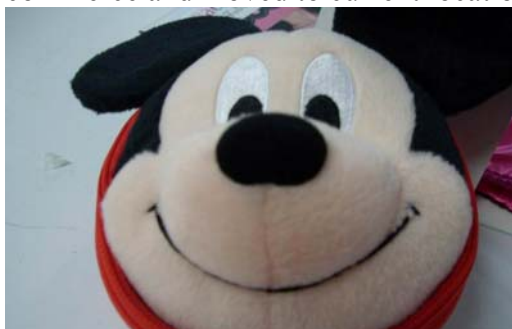
Image: Product provide by a Pearl Tower worker. Mickey Mouse is a trademark of Disney.

Pearl Tower Garments & Toys (Shenzhen) Co. LTD is invested by Bao Tai, a Hong Kong-based corporation. The factory mainly produces stuffed dolls, doll garments, stationeries, handbags, plastic toys and etc. Products are mainly exported to Europe, Japan, the U.S. and etc. The factory's original name was Shishen Toy Factory. On November 21 st 1992, the factory registered itself as Pearl Tower (Bao Tai) at the department of industry and commerce and moved to current location.