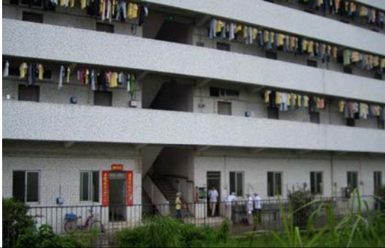
Image: Photograph shows AOYAGI's cafeteria and dormitory.

Accommodation is provided by AOYAGI at no charge, and each dorm room houses four workers.