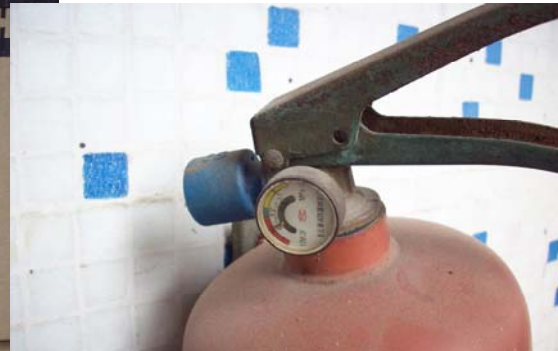
Image: Fire extinguisher found in Duoyuan, the meter pointed in red.

denied the necessary training upon recruitment, and are thus further susceptible to the risks involved with using factory machinery. Induction heating machines and cutting machines are particularly high-risk. However, the only notice posted on induction heating machines is "careful of high temperature."