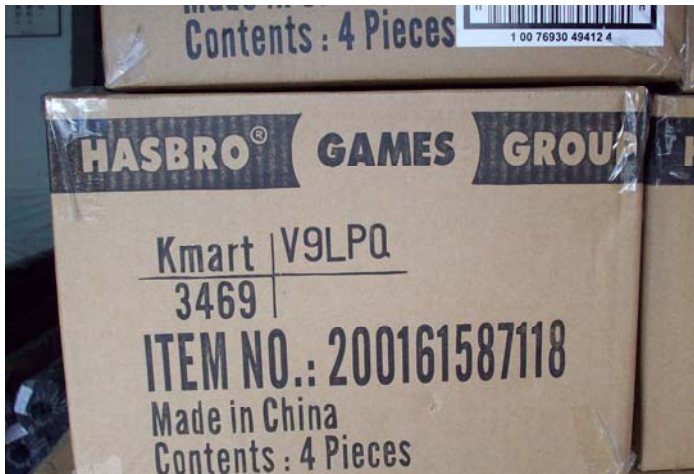
Image: Boxes of Hasbro toys stored in Duoyuan waiting to be shipped to their destinations.

Duoyuan consists of four departments; cutting, silk print, high frequency induction heating, and packaging. Each product must first go through the cutting department, and the department will then cut the PVC materials according to each brand's request. The PVC material will then be ported to the silk print department to print brand names. After printing, the material will be sent to the high frequency induction heating department for compression. Finally, each product will be sent to the packaging department for packaging.