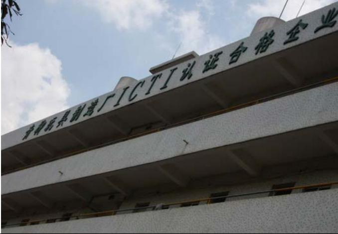
Image: Factory is ICTI certified industry written in Chinese.

AOYAGI requires workers to work five days a week. Each work day is eight hours, and there is also three hours of regular daily overtimes. Overtimes on Saturdays are depending on the situations, and Sundays are usually off days.