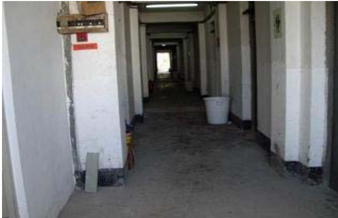
Image: Pearl Tower Dormitory image taken by CLW investigator

Each dormitory room houses ten workers, with bunk beds and a fan installed in the room.