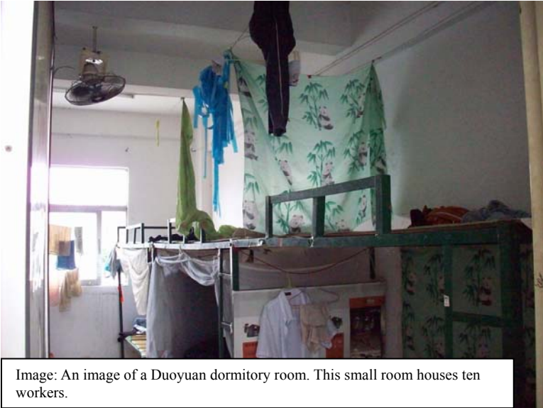
Image: An image of a Duoyuan dormitory room. This small room houses ten workers.

Duoyuan enforces a $2 RMB/day meal fee on all workers. The cafeteria offers three meals daily, breakfast consists of congee, and lunch and dinner include three dishes per meal. The dishes consist of tomato and potato etc. Each meal is provided before the worker's meal break, though it lacks quantity and quality.