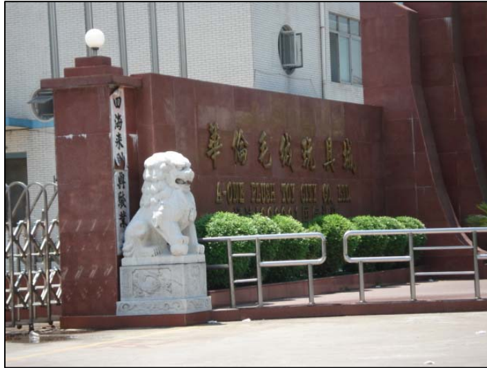
Image:.. Factory gates before renaming.