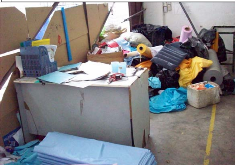
Image: Ordinary work environment of Duoyuan makes one wonder the quality and safety of production.

Duoyuan installed fire extinguishers in the dormitory hallways, the extinguishers are rusty and dusty, pointing to the absence of safety check-ups. In addition, many fire extinguishers lack pressure, thus incapable for its purpose. According to China's national regulatory laws, fire extinguishers need to be recharged if the pressure is below standard.