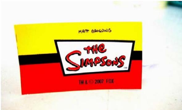
Image: Tag obtained from Pearl Tower. Simpson is a trademark of Fox TM.