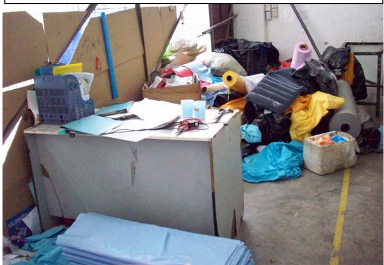
Image: Ordinary work environment of Duoyuan makes one wonder the quality and safety of production.

Duoyuan installed fire extinguishers in the dormitory hallways, the extinguishers are rusty and dusty, pointing to the absence of safety check-ups. In addition, many fire extinguishers lack pressure, thus incapable for its purpose. According to China's national regulatory laws, fire extinguishers need to be recharged if the pressure is below standard.