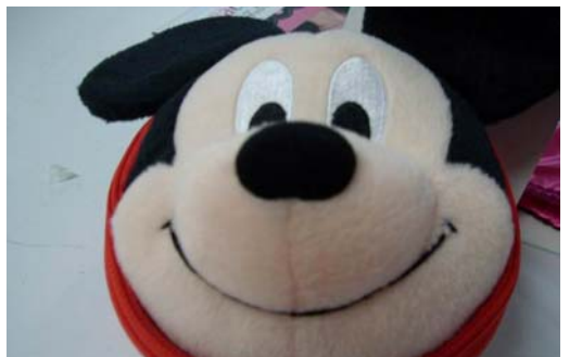
Image: Product provide by a Pearl Tower worker. Mickey Mouse is a trademark of Disney.