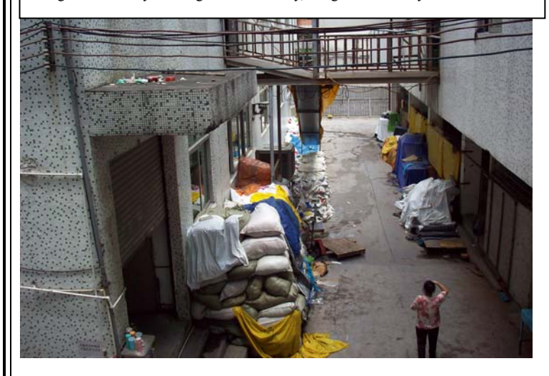
Image: The factory is unorganized and dirty, image shows Duoyuan's true color.

The work environment is very dirty and unorganized. One can see raw materials, work equipment, garbage, unfinished products and finished products piled up at random locations, including the emergency exits.