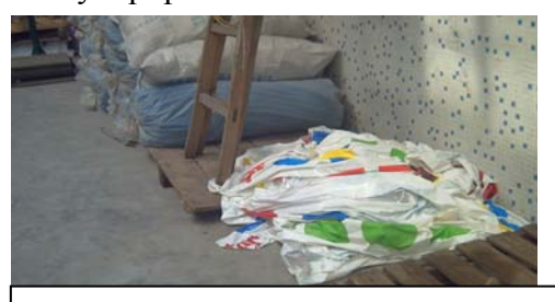
Image: Image of a pile of Twister, Hasbro's product being tossed aside in the factory.

Chemicals such as paint and diluents are used in the silk print department. However, Duoyuan does not provide any related chemical information nor does it distribute any safety equipment.